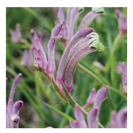
SOFT PURPLE CELEBRATIONS™ CARNIVAL KANGAROO PAW Anigozanthos 'Carnival' PPAF 16" tall, 20" wide. Partial to full sun. Evergreen SKU #45485 | ZONE: 9-11

THESE AMAZING COLORS, NEVER BEFORE SEEN ON ANIGOZANTHOS, have been drawing eyes and creating buzz ever since their release. There are plenty of benefits beyond these fabulous blooms. This perennial is tough, durable, and drought-resistant, and the compact size is great for small gardens and containers.