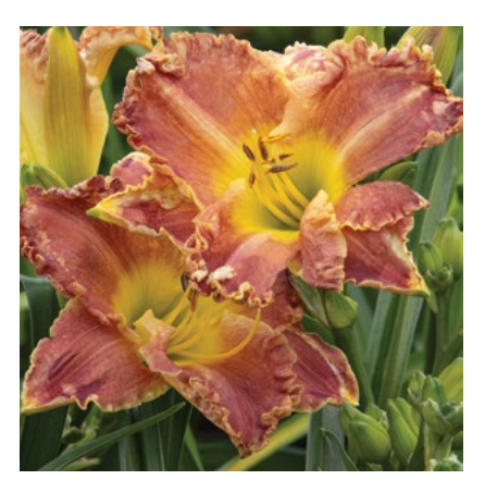
GIANT BLOOMS TITAN SKYE™ DAYLILY Hemerocallis x 'MON7091' PPAF 18" tall and wide. Full sun. Perennial SKU #44428 | ZONE: 4-11