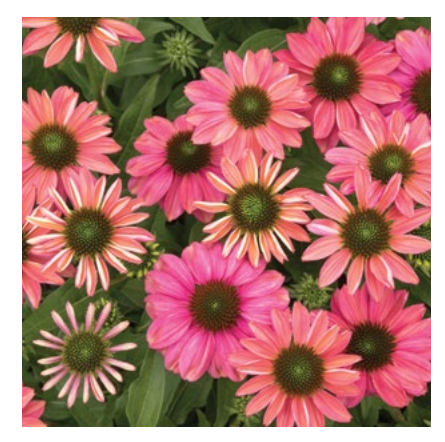
CHARMING COLOR VARIATIONS EVOLUTION™ COLORIFIC™ CONEFLOWER Echinacea 'Balevoeen' PP #30,998 20" tall, 18" wide. Full sun. Perennial SKU #41360 | ZONE: 4-9

LONG-LASTING BLOOMS AND A TIDIER HABIT make these coneflowers ideal for pots, beds, and borders. Lush foliage and sturdy, upright stems create a beautiful backdrop for other perennials. Bright blooms bring color late spring through fall, sailing through the heat of summer.