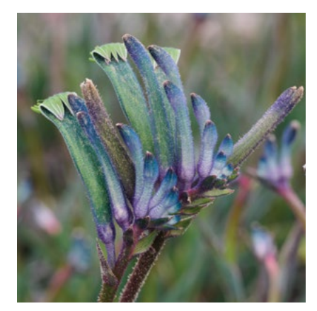
PEACOCK BLUE AND PURPLE CELEBRATIONS™ MARDI GRAS KANGAROO PAW Anigozanthos 'Mardi gras' PPAF 16" tall, 20" wide. Partial to full sun. Evergreen SKU #45486 | ZONE: 9-11