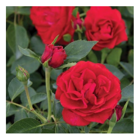
RUFFLY AND REGAL NITTY GRITTY™ RED ROSE Rosa x 'RUIR10023A' PP #33,585 Fast growing; 3' tall, 4' wide. Partial to full sun. Deciduous SKU #42047 | ZONE: 4-9

ENJOY THE BEAUTY OF ROSES AS A CAREFREE GROUNDCOVER. Blooms nonstop early summer to autumn. Excellent disease resistance provides beautiful glossy green foliage. Self-cleaning and own-root.