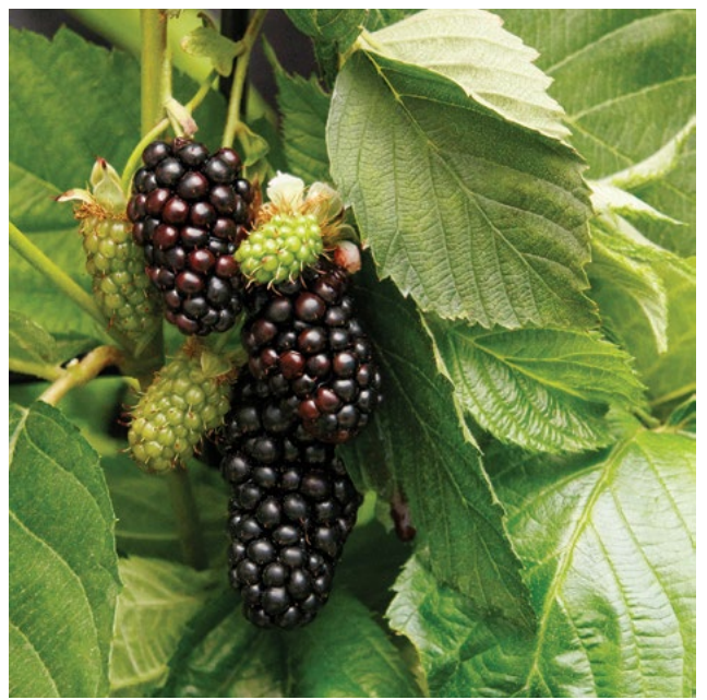
COMPACT AND THORNLESS SUPERLICIOUS™ BLACKBERRY Rubus x 'A-2500T' PPAF

This small fig is perfect for urban gardens, or growing in containers inside or out, reaching only 28 inches tall and wide. Medium-sized, deep brown fruit is pink-red on the inside and deliciously sweet. Fruits heavily throughout the year. 28" tall and wide. Full sun. Deciduous SKU #45113 | ZONE: 7-10