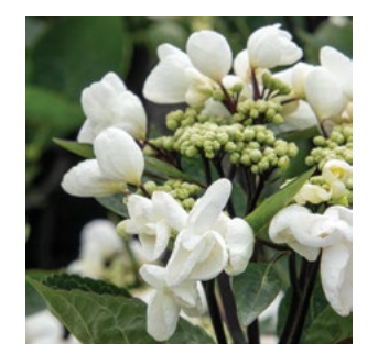
GLACIER BAY HYDRANGEA Hydrangea macrophylla 'CAMCHO45' PPAF Crisp pure-white lacecap blooms are held on black stems. Partial sun. Deciduous SKU #43339 | Zone: 4-9