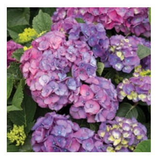
NEWPORT HYDRANGEA Hydrangea macrophylla 'HORTMANI' PP #28,085

Mophead blooms become darker purple with a more vivid blue eye in acidic soils. Partial sun. Deciduous SKU #42330 | ZONE: 4-9