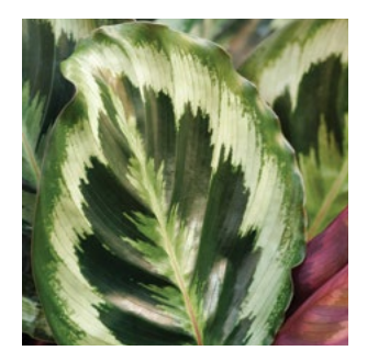
MARION PRAYER PLANT Calathea 'Marion' The small size is great for shelves and table tops. 6 to 12" tall and wide. Filtered sun SKU #45124