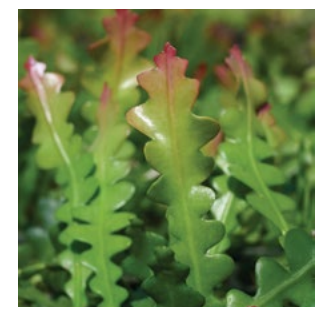
FISHBONE CACTUS Epiphyllum anguliger This epiphytic cactus from Mexico is great for hanging planters. Stems reach 12" long. Filtered sun SKU #45533