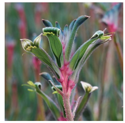
TEAL WITH A HOT PINK BASE CELEBRATIONS™ FIREWORKS KANGAROO PAW Anigozanthos 'Fireworks' PPAF 16" tall, 20" wide. Partial to full sun. Evergreen SKU #45482 | ZONE: 9-11