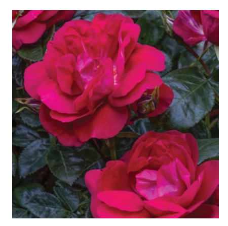
GLOWING PINK GRACE N' GRIT™ PINK SHRUB ROSE Rosa 'Meicerafyn' PP #31,069 5' tall, 4' wide. Full sun. Deciduous SKU #42116 | ZONE: 4-9

THESE ROMANTIC ROSES GROW WITH THE EASE OF FLOWERING SHRUBS. Proven to thrive coast-to-coast, Grace N' Grit<sup>™</sup> Roses have lived up to their name, thriving in heat and humidity as well as hot, dry summers. Self-cleaning and own-root with excellent disease resistance.