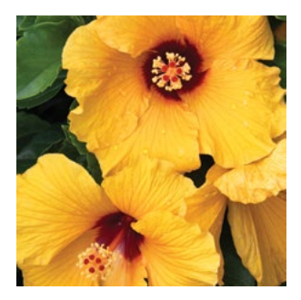
GLOWING BLOSSOMS WITH A DEEP CRIMSON CENTER JAZZY JEWEL® GOLD HIBISCUS Hibiscus rosa-sinensis 'BH-03' PPAF 4' tall and 5' wide in the landscape. Full sun. Evergreen in frost-free areas SKU #43645 | ZONE: 9-11