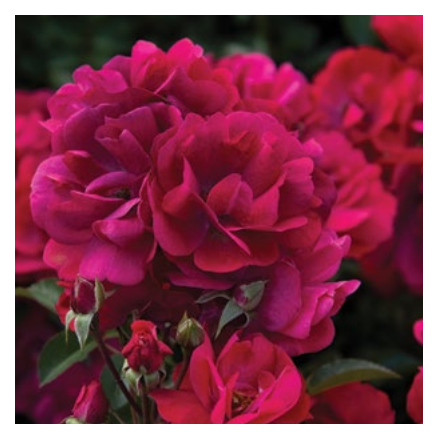
DARK, BOLD BLOOMS NITTY GRITTY™ PINK ROSE Rosa x 'RUIRI0125A' PP #33,135 Fast growing; 3' tall, 4' wide. Partial to full sun. Deciduous SKU #42230 | ZONE: 4-9