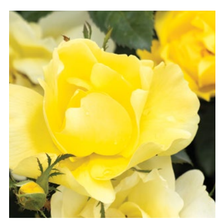
SUNNY BLOSSOMS NITTY GRITTY™ YELLOW ROSE Rosa x 'RUIRI0109A' PP #33,134 Fast growing; 3' tall, 4' wide. Partial to full sun. Deciduous SKU #42229 | ZONE: 4-9