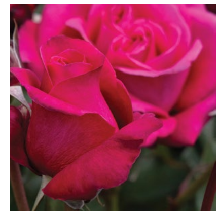
VIBRANT FUCHSIA COLOR EAU DE PARFUM™ BLING ROSE Rosa 'Noa16079' PPAF 4' tall and wide. Full sun. Deciduous SKU #43157 | ZONE: 5-10