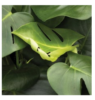
DWARF SWISS CHEESE PLANT Monstera deliciosa 'Tauerii' Smaller than the classic, but still makes a big impact! 4 to 6' tall. Filtered sun SKU #45338