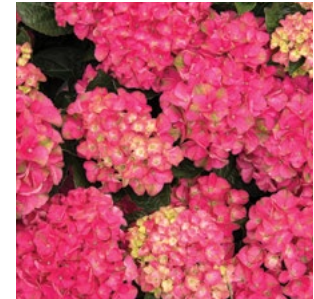
MARTHA'S VINEYARD HYDRANGEA Hydrangea macrophylla 'HORTMAVI' PP #31,352

Mophead blooms become darker purple with a more vivid blue eye in acidic soils. Partial sun. Deciduous SKU #42330 | ZONE: 4-9