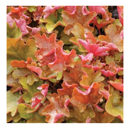
WONDERFUL RUFFLES SIENNA SUNRISE® HEUCHERA Heuchera 'DOHEUGABERU' PPAF Gray-green leaves with orange blushes are delightfully wavy and cupped, showing off their colorful, bright pink undersides. 12" tall, 14" wide. Partial sun. Perennial