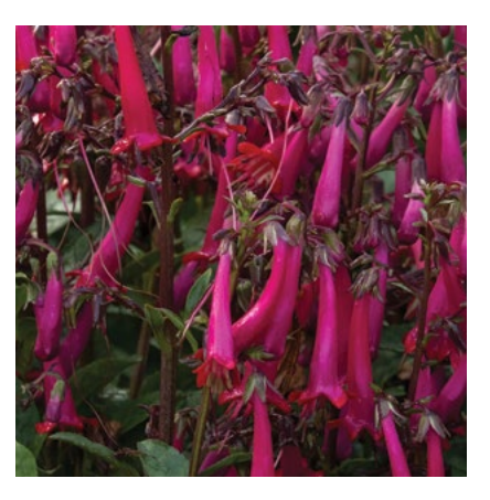
DARK BUDS AND MAGENTA BLOOMS COLORBURST™ ROSE CAPE FUCHSIA Phygelius 'TNPHYCRO' PPAF 3' tall, 2' wide. Partial sun. Perennial SKU #42884 | ZONE: 6-10