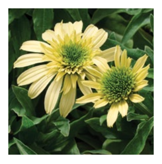
UNIQUE PETALS SUNDIAL ZENITH CONEFLOWER

COMPACT CLASSIC SHORTSTOP™ SHASTA DAISY Leucanthemum 'TNLEUS' PP #31,456 Classic daisy flowers on a compact plant with a tight, low habit. Bright white petals with a rich yellow center. 15" tall and wide. Full sun. Perennial SKU #42880 | ZONE: 4-9