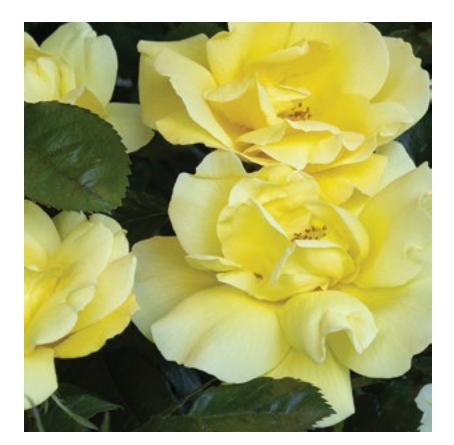
CLEAR YELLOW BLOOMS GRACE N' GRIT™ YELLOW SHRUB ROSE Rosa 'Radmonyel' PP #30,571 5' tall, 4' wide. Full sun. Deciduous SKU #42119 | ZONE: 4-9