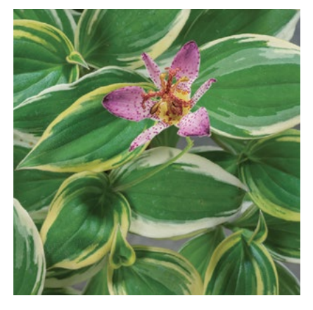
UNIQUE BLOOMS NINJA STAR TOAD LILY Tricyrtis formosana 'Kristen' PP #33,439

COLOR FOR SUN CASABLANCA® LANTANA Lantana 'PII-LC1' PPAF A cold hardy selection with a natural spreading habit for beds or as a groundcover. Repeat blooms during warm season. 18" tall, 36" wide. Full sun. Evergreen in frost-free areas. SKU #45702 | ZONE: 8-11