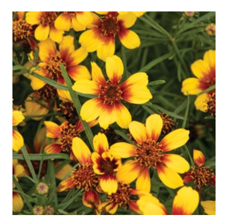
DEEP YELLOW AND ORANGE SUNSTAR™ ORANGE COREOPSIS Coreopsis verticillata 'TNCORSO' PPAF 24" tall, 30" wide. Full sun. Perennial SKU #42889 | ZONE: 4-10

THIS COLORFUL COLLECTION features vivid blooms from late spring nonstop through summer. Mildew-resistant foliage remains attractive when others suffer. Perfect for adding cottage charm.