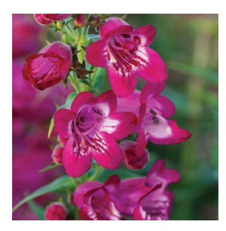
VIVID COLOR HARLEQUIN™ MAGENTA BEARDTONGUE Penstemon 'TNPENHM' PPAF 22" tall, 16" wide. Full sun. Perennial SKU #43415 | ZONE: 5-9

THIS EASY-GROWING, DISEASE-RESISTANT PLANT with a bushy, compact habit and very long bloom period thrives even in poor, dry soils and loves full sun, fitting for Western regions.