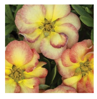
LOADS OF BLOOMS GINGERSNAP™ POTENTILLA Potentilla fruticosa 'Hachapp' PPAF Features flowers that do not fade and appear throughout the summer, evenly from the top to the bottom of the shrub. Deerand rabbit-resistant. 3' tall and wide. Partial to full sun. Deciduous SKU #44431 | ZONE: 3-8