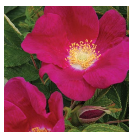
DEEP RED SINGLE BLOOMS SEASIDE SWIRL™ RED RUGOSA ROSE Rosa rugosa 'RUIRJ0110A' PPAF 3' tall and wide. Full sun. Deciduous SKU #42706 | ZONE: 3-9