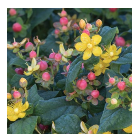
ROSE-PINK BERRIES FLORALBERRY® ROSÉ ST. JOHN'S WORT Hypericum x inodorum 'KOLROS' PPAF 3' tall and wide. Partial shade to full sun. Deciduous SKU #41798 | ZONE: 5-9