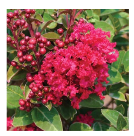
LOADS OF BLOOMS SUMMERLASTING* STRAWBERRY CRAPE MYRTLE Lagerstroemia indica 'HOCH266' PP #34,124 3' tall and wide. Full sun. Deciduous SKU #43910 | ZONE: 7-10