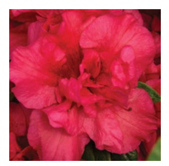
RICH DOUBLE BLOOMS DOUBLE SHOT® SALMON AZALEA Azalea x 'RLH1-10P18' PP #24,493 3' tall and wide. Full shade to partial sun. Evergreen SKU #42062 | ZONE: 6-9

COMPACT, REBLOOMING AZALEAS that display large flowers twice a year! Four vibrant colors are available to be enjoyed in spring, and again in late summer. The vigorous, rounded habit with dense foliage exhibits better heat and cold tolerance than other varieties.