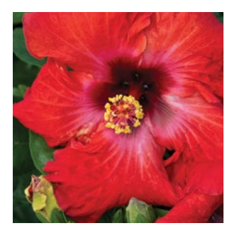
SENSATIONAL BLOOMS WITH HUES OF RED AND PINK JAZZY JEWEL® RUBY HIBISCUS Hibiscus rosa-sinensis '13008' PPAF 4' tall and 5' wide in the landscape. Full sun. Evergreen in frost-free areas SKU #43644 | ZONE: 9-11

THIS COLLECTION OF SHRUBS ADDS BEAUTY and a touch of the tropics to gardens everywhere. Naturally well-branched plants provide more blooms that last longer. The glossy, deep green foliage has improved resistance to pests and disease.