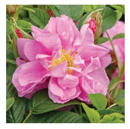
SOLID PINK DOUBLE BLOOMS SEASIDE SWIRL™ PINK RUGOSA ROSE Rosa rugosa 'RUIRJ0078A' PPAF 3' tall and wide. Full sun. Deciduous SKU #42703 | ZONE: 3-9