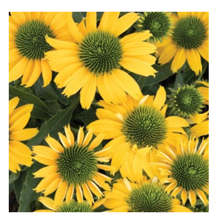
LOVELY RELAXED PETALS EVOLUTION™ EMBERS™ SPARKS CONEFLOWER Echinacea 'TNECHES' PP #31,494 20" tall, 18" wide. Full sun. Perennial SKU #42875 | ZONE: 4-9