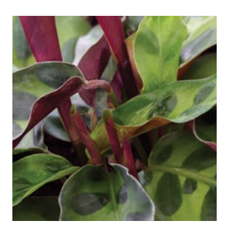
RATTLESNAKE PLANT Calathea lancifolia A colorful plant with a delightful bushy habit. 2' tall. Filtered sun SKU #45339