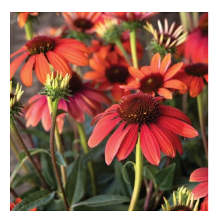
ATTRACTS POLLINATORS EVOLUTION™ FIESTA CONEFLOWER Echinacea 'Balevoesta' PP #31,029 20" tall, 18" wide. Full sun. Perennial SKU #41359 | ZONE: 4-9