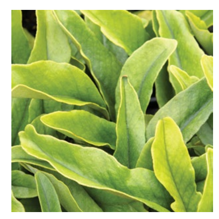
LOW WATER NEEDS JURASSIC™ BRONTOSAURUS TONGUE FERN Pyrrosia 'MONBRTS'

GATHERED THROUGHOUT ASIA BY DAN HINKLEY, this unique collection of ferns add a variety of textures to woodland gardens. With six distinctly different species, there is a variety that will thrive in nearly any type of shady location.