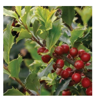
ABUNDANT WINTER BERRIES MAGICAL<sup>®</sup> AMORE HOLLY Ilex x meserveae 'Seiholly'

This upright, pyramidal holly provides an extra touch of color in spring, with merlot new growth. Bright red berries provide winter interest. Needs a male pollinizer for berry set, 12 to 15' tall, 8 to 10' wide. Partial to full sun. Evergreen SKU #42569 | ZONE: 5-9