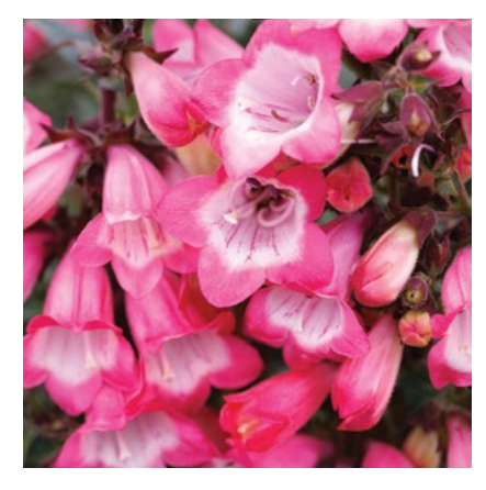
ROSY PINK WITH WHITE THROATS HARLEQUIN™ PINK BEARDTONGUE Penstemon 'TNPENHPI' PPAF 22" tall, 16" wide. Full sun. Perennial. SKU #43416 | ZONE: 5-9