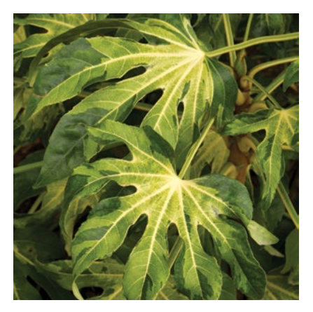
GREAT INDOORS AND OUT CAMOUFLAGE® VARIEGATED JAPANESE ARALIA Fatsia japonica 'Variegata'

This hardy shrub lends a tropical look with unique foliage. Suitable as a houseplant in cold zones. White flowers in winter. 8' tall and wide. Full shade to partial sun. Evergreen SKU #03303 | ZONE: 7-10