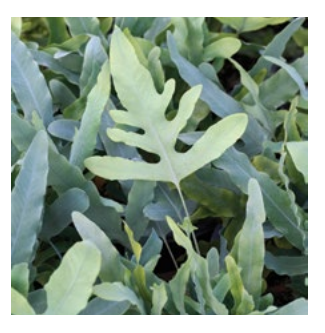
BLUE STAR FERN Phlebodium aureum An easy-care fern for pots or humid terrariums. 2 to 3' tall and wide. Filtered sun SKU #45280