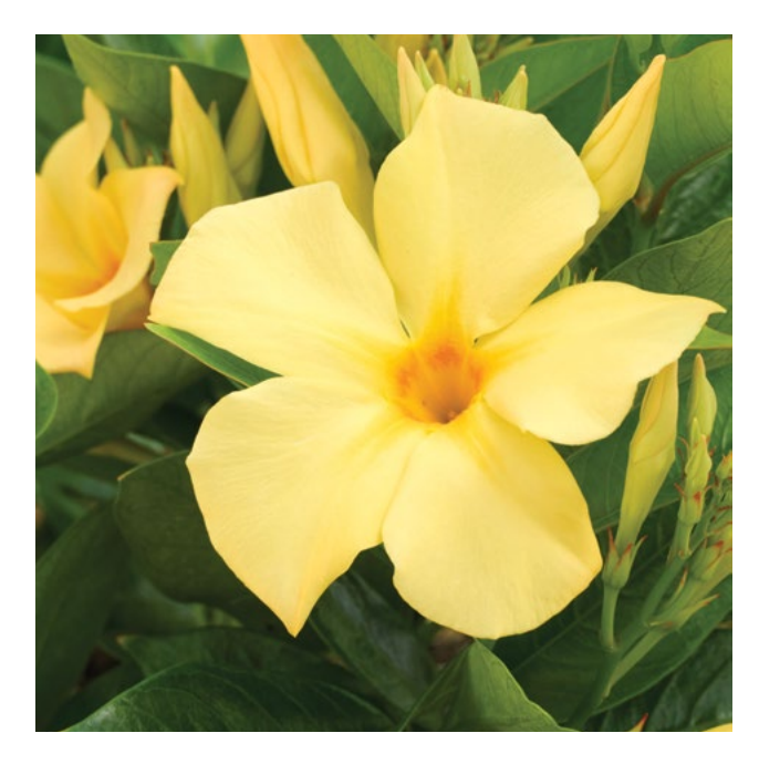
COMPACT VARIETY SUN PARASOL® SUNBEAM MANDEVILLA Mandevilla 'Sunbeam'

This compact, bushy grower is perfect for containers, hanging baskets, or garden beds. If led upwards on a trellis, it maintains a bushy habit. 1 to 2' tall, 2 to 3' wide. 3' tall on a trellis. Partial to full sun. Frost-tender evergreen