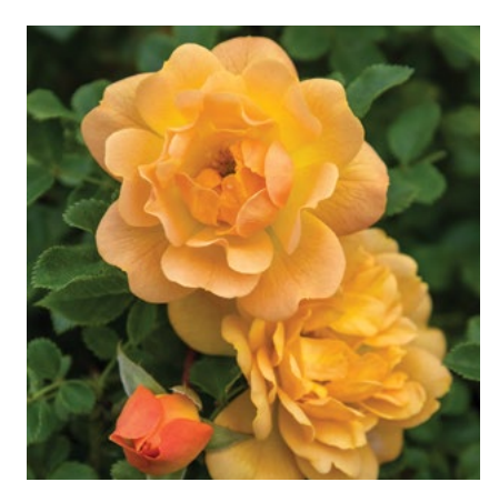
ITSY BITSY® PEACH MINIATURE ROSE Rosa x 'Meikapette' PPAF

This little cutie blooms in abundance throughout the growing season, with deep yellow and orange blooms with light blushes of pink. Perfect in the garden or in containers. Has excellent resistance to mildew and rust. 18" tall, 24" wide. Full sun. Deciduous