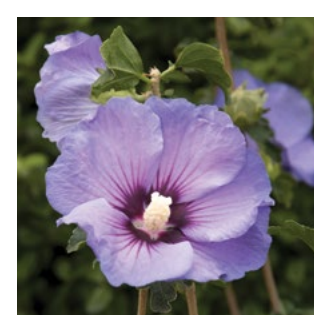
GORGEOUS VIOLET-BLUE BLOOMS CHATEAU™ DE VERSAILLES ROSE OF SHARON

THESE ENCHANTING ROSE OF SHARON provide months of beautiful flowers that cover the stems from top to bottom. Masses of 3-inch-wide blooms flower nonstop from early summer to autumn on a graceful, vase-shaped shrub.