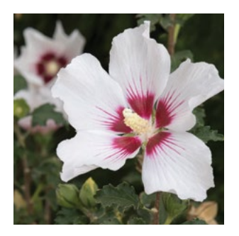
CLEAR WHITE BLOOMS WITH CRIMSON CENTERS CHATEAU™ DE CHANTILLY ROSE OF SHARON

Hibiscus syriacus 'Minsyble9' PP #31,152 Fast growing: 6' tall, 4' wide. Partial to full sun. Deciduous SKU #40947 | ZONE: 5-9