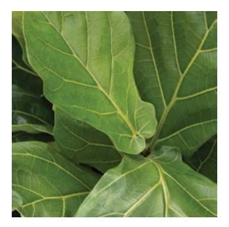
FIDDLE LEAF FIG Ficus lynata This popular indoor tree will be the focal point of any room. 10' tall, 3' wide. Filtered sun SKU #44592