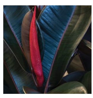
ABIDJAN RUBBER PLANT Ficus elastica 'Abidjan' New leaves emerge covered with a bright red sheath for an extra splash of color. 6' tall, 2' wide. Filtered sun SKU #44610