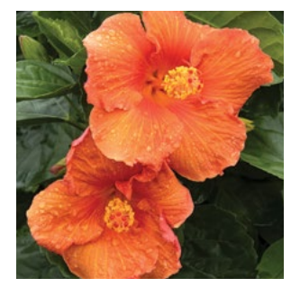
BEAUTIFUL DEEP SAFFRON BLOOMS JAZZY JEWEL® AMBER HIBISCUS Hibiscus rosa-sinensis 'RH-05' PPAF 4' tall and 5' wide in the landscape. Full sun. Evergreen in frost-free areas SKU #43646 | ZONE: 9-11