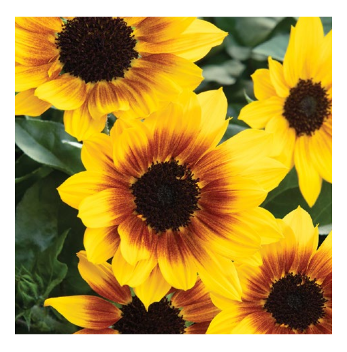
UNIQUE SUNFLOWER SUNBELIEVABLE™ BROWN EYED GIRL HELIANTHUS Helianthus x annuus 'TMSNBLEV01' PP #31,423 Compact habit to 32" tall and 40" wide. Full sun. SKU #43002 | ZONE: ALL

A SUNFLOWER UNLIKE ANY YOU HAVE SEEN BEFORE. One plant produces 1,000 blooms, flowering continuously from spring to first frost. Sterile blooms allow the plant to put more energy into flower production. Attracts bees and other pollinators while standing up to the hot, dry weather of summer. A great alternative to mums in autumn.