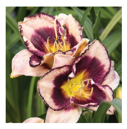
DRAMATIC CONTRAST STORMY SKYE™ DAYLILY Hemerocallis x 'MON7035' PPAF 18" tall and wide. Full sun. Perennial SKU #44427 | ZONE: 4-11

THESE IMPROVED VARIETIES REBLOOM throughout the summer, providing waves of color and thriving in a wide range of soils and conditions. Blooms sit just above the foliage on a compact plant that will fit any garden.