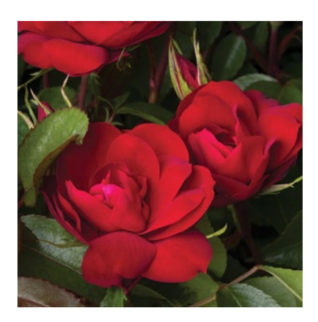
CONTAINER OR LANDSCAPE GRACE N' GRIT™ RED SHRUB ROSE Rosa 'Meizygglie' PP #31,077 5' tall, 4' wide. Full sun. Deciduous SKU #42124 | ZONE: 4-9