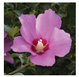
LOVELY PINK BLOOMS WITH RASPBERRY CENTERS CHATEAU™ D'AMBOISE ROSE OF SHARON

Hibiscus syriacus 'Minsymacwhi1' PP #31,266 Fast growing: 6' tall, 4' wide. Partial to full sun. Deciduous SKU #40950 | ZONE: 5-9