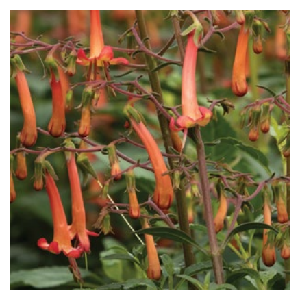
LIKE A SUNSET COLORBURST™ ORANGE CAPE FUCHSIA Phygelius 'TNPHYCO' PPAF 3' tall, 2' wide. Partial sun. Perennial SKU #42886 | ZONE: 6-10