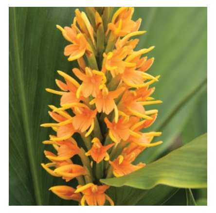
BOLD COLOR MISHIMI FIRE™ GINGERLILY Hedychium coccineum 'DH16057'

Fragrant orange flower spikes and green, blade-like foliage lend a tropical look to the garden. Loves hot and humid summers. Can be overwintered indoors where not hardy. 3' tall and wide. Partial to full sun. Perennial SKU #42496 | ZONE: 7-10