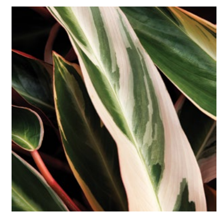
TRIOSTAR STROMANTE Stromanthe sanguinea 'Triostar' Brings bright color into the home. 3' tall, 2' wide. Filtered sun to full shade SKU #04791