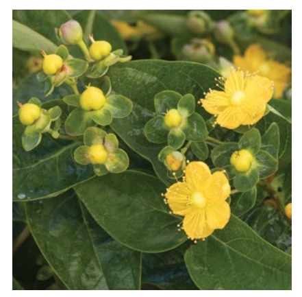
BRIGHT YELLOW BERRIES FLORALBERRY® CHARDONNAY ST. JOHN'S WORT Hypericum x inodorum 'KOLCHAR' PPAF 3' tall and wide. Partial shade to full sun. Deciduous SKU #41808 | ZONE: 5-9