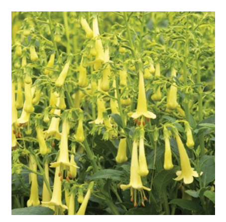
CRISP LEMON LIME COLORBURST™ YELLOW CAPE FUCHSIA Phygelius 'TNPHYCY' PPAF 3' tall, 2' wide. Partial sun. Perennial SKU #42882 | ZONE: 6-10