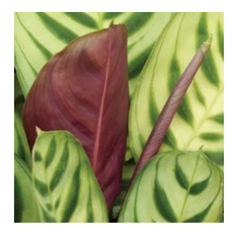
MARANTA Maranta amagris Spreads wider than tall, making it a good option for hanging baskets. 12" tall, 18 to 24" wide. Filtered sun SKU #45745