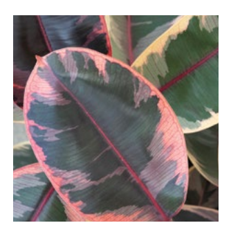
BELIZE RUBBER PLANT Ficus elastica 'Belize' A colorful variety with a dazzling array of green, pink, and cream. 6' tall, 2' wide. Filtered sun SKU #44607