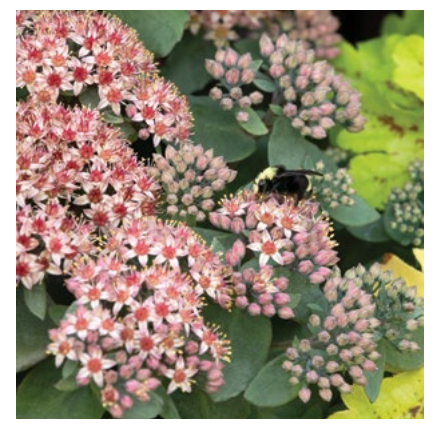
LOVED BY POLLINATORS EVOLUTION™ EMERALD ICE SEDUM Sedum 'TNSEDEEI' PPAF 15" tall and wide. Partial to full sun. Evergreen in mild winter regions. SKU #42881 | ZONE: 4-9