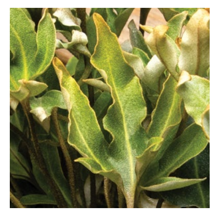
UNIQUE FOLIAGE JURASSIC™ TRICERATOPS FINGER FERN Pyrrosia polydactyla 'MONTRCT'

Add airy, feathery texture to a shady spot with the arching fronds of this clump-forming fern. Pale green fronds unfurl from red stems, creating a two-toned look with the older, dark-green foliage. 18" tall and wide. Full to partial shade SKU #41367 | ZONE: 6-9