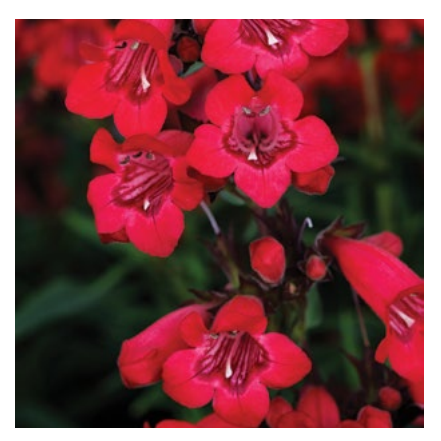
DARK BUDS AND DEEP RED BLOOMS HARLEQUIN™ RED BEARDTONGUE Penstemon 'TNPENHR' PPAF 22" tall, 16" wide. Full sun. Perennial SKU #43418 | ZONE: 5-9