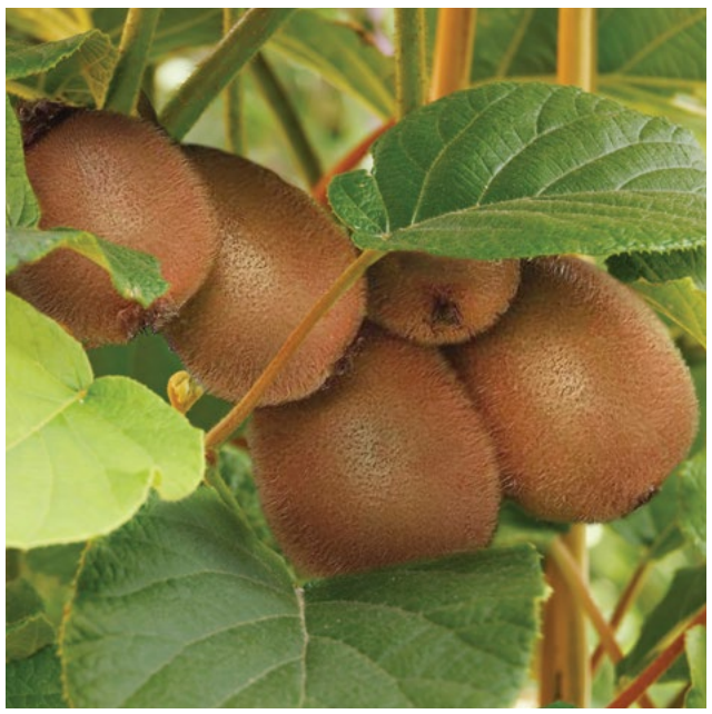
SELF-FERTILE SWEET N' SOLO™ KIWI