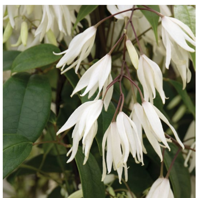
EXOTIC FRAGRANCE HEAVENLY ASCENT® HOLBOELLIA VINE Holboellia brachyandra 'HWJ1023'

Rare and exotic, this vine bears large, white, melon-scented flowers in spring. If pollinated, it puts on a second show with its edible, purplish-blue fruit. Twining stems to 20' tall, with support. Full sun. Evergreen SKU #05638 | ZONE: 8-10