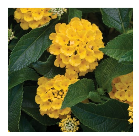
SUNNY YELLOW BLOOMS FIESTA™ PINA LANTANA Lantana camara 18" tall, 30" wide. Full sun. Evergreen SKU #46433 | ZONE: 10-11

COLORFUL, STERILE FLOWERS ARE A FESTIVE ADDITION to gardens in warmer areas, or use as an annual where not hardy. Slightly trailing habit is perfect for hanging baskets and containers.