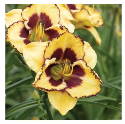
A BOLD STATEMENT BLAZING SKYE™ DAYLILY Hemerocallis x 'MON7082' PPAF 18" tall and wide. Full sun. Perennial SKU #44425 | ZONE: 4-11