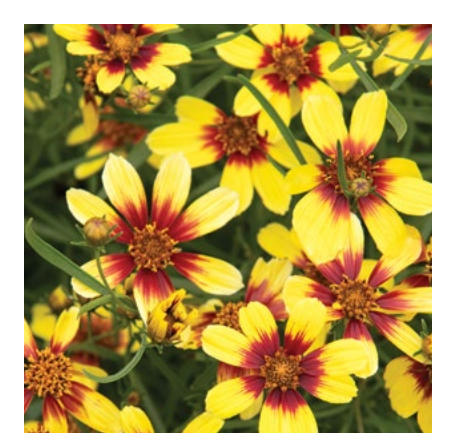
BRIGHT YELLOW AND DEEP RED CENTERS SUNSTAR™ GOLD COREOPSIS Coreopsis verticillata 'TNCORSG' PP #30,997 24" tall, 30" wide. Full sun. Perennial SKU #42888 | ZONE: 4-10

ROSE-PINK AND CREAM SUNSTAR™ ROSE COREOPSIS Coreopsis verticillata 'TNCORSR' PP #30,996 24" tall, 30" wide. Full sun. Perennial SKU #42887 | ZONE: 4-10