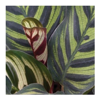
PEACOCK PLANT Calathea makoyana Beautiful foliage for low light situations. 2' tall. Filtered sun SKU #45279QT