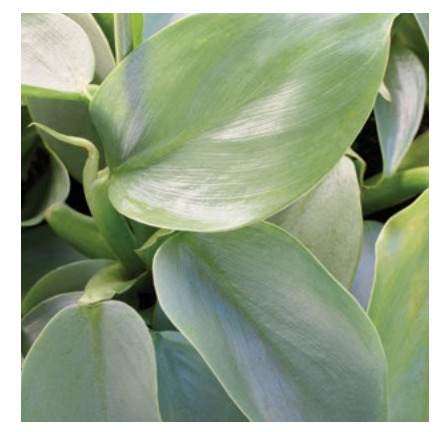
SILVER SWORD PHILODENDRON Philodendron hastatum Big dramatic leaves on a vining variety that will climb, with support, up to 3' tall. Filtered sun SKU #45343