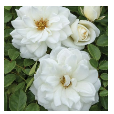
NEWEST ADDITION GRACE N' GRIT™ WHITE SHRUB ROSE Rosa hybrida 'Meidyceus' PP #32,903 5' tall, 4' wide. Full sun. Deciduous SKU #44600 | ZONE: 4-9