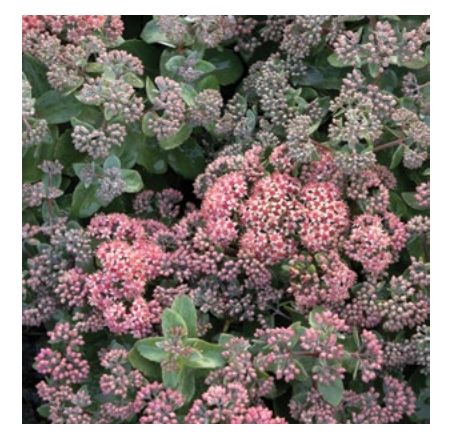
SUMMER COLOR EVOLUTION™ PURPLE CRUSH SEDUM Sedum 'TNSEDEPC' PPAF 15" tall and wide. Partial to full sun. Evergreen in mild winter regions. SKU #42877 | ZONE: 4-9