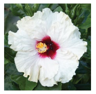
STRIKING WHITE FLOWER WITH DEEP RED CENTER JAZZY JEWEL® OPAL HIBISCUS Hibiscus rosa-sinensis 'AH-51' PPAF 4' tall and 5' wide in the landscape. Full sun. Evergreen in frost-free areas SKU #44458 | ZONE: 9-11