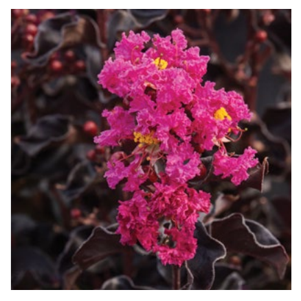
EARLIEST FLOWERING SUMMERLASTING® RASPBERRY CRAPE MYRTLE Lagerstroemia indica 'HOCH631' PP #33,208 3' tall and wide. Full sun. Deciduous SKU #43916 | ZONE: 7-10