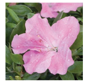
SOFT PURPLE-PINK HUE DOUBLE SHOT® LAVENDER AZALEA Azalea x 'RLH1-12P0' PP #24,467 3' tall and wide. Full shade to partial sun. Evergreen SKU #42059 | ZONE: 6-9