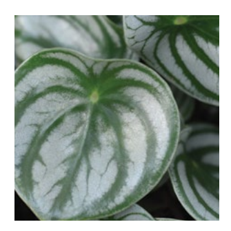
WATERMELON PEPEROMIA Peperomia argyreia Striking melon pattern. Easy-care species. 6 to 12" tall and wide. Filtered sun SKU #45344

A great cut-leaf variety. Exceptionally dense, compact, and will not vine. 3' tall, 4' wide. Filtered sun SKU #45135