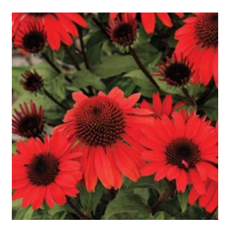
LONG BLOOM SEASON PANAMA™ RED CONEFLOWER Echinacea x

Enjoy deep red flowers with dark centers over a long bloom season on this short and compact variety. The smaller size is great for containers. 14" tall and wide. Full sun. Perennial