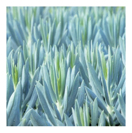
MOUNT EVEREST BIG BLUE CHALKSTICKS Senecio ficoides 'Mount Everest' PP #22,188 A stunning upright form that will dwarf other potted succulents. 2' tall and wide in containers. Partial to full sun SKU #43132