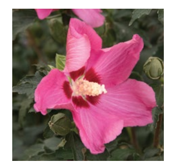
ROSY-PINK BLOSSOMS WITH DEEP RED CENTERS CHATEAU™ DE CHAMBORD ROSE OF SHARON

Hibiscus syriacus 'Minsypin3' PP #31,304 Fast growing: 6' tall, 4' wide. Partial to full sun. Deciduous SKU #40952 | ZONE: 5-9