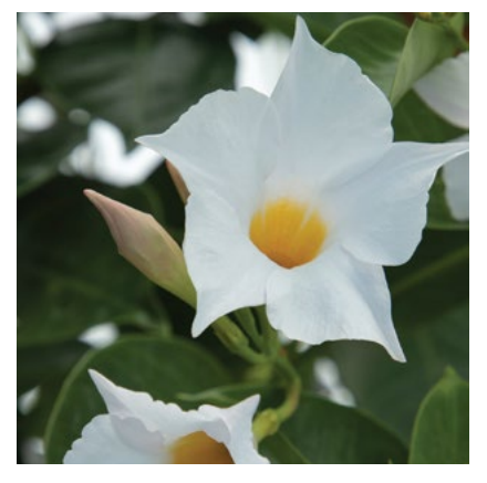
CRISP, PURE WHITE SUNVILLA™ WHITE MANDEVILLA Mandevilla 'MANZ0020' PPAF Stems to 20' long. Partial to full sun. Evergreen in frost-free areas. SKU #44338 | ZONE: 9-11