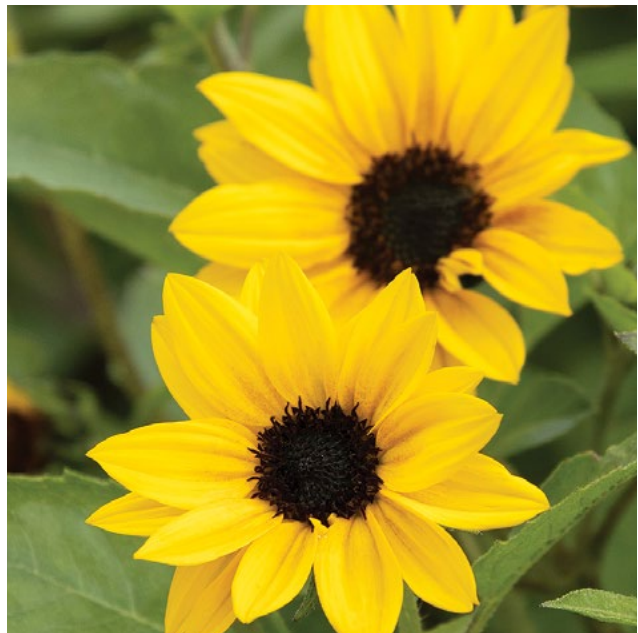
SUNNY YELLOW BLOOMS SUNBELIEVABLE™ GOLDEN GIRL HELIANTHUS Helianthus x annuus 'TMSNBLEV16/1' PP #33,172 Compact habit to 32" tall and 40" wide. Full sun. SKU #43085 | ZONE: ALL