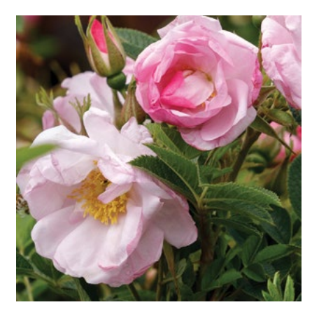
TOUCH OF PINK SEASIDE SWIRL™ BLUSH RUGOSA ROSE Rosa rugosa 'BORUIWHIVA' PPAF 3' tall and wide. Full sun. Deciduous SKU #42708 | ZONE: 3-9

TERRIFIC AMOUNTS OF BEAUTIFUL BLOOMS on a smaller, far more compact plant than others of its kind. Blooms from mid-spring all the way into fall. A great, easy-care option for tough conditions, this extra-cold-hardy rose is tolerant of sea spray and road salt.