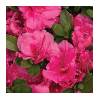
FRILLY DEEP PINK FLOWERS DOUBLE SHOT® WATERMELON AZALEA Azalea x 'RLH1-9P7' PP #27,877 3' tall and wide. Full shade to partial sun. Evergreen SKU #41201 | ZONE: 6-9