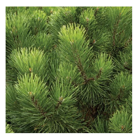
NEVER DULL LITTLE RICK™ MUGO PINE Pinus mugo 'MonJaw' PP #32,350

DENSE GROWTH UPSTANDING™ EMERALD ARBORVITAE Thuja occidentalis 'SMTOBM3' PPAF Deep green foliage forms a dense, pyramidal form. Spire-like growth is perfect grouped as a hedge or screen. Tough, partly shade tolerant. 15' tall, 8' wide. Full sun. Evergreen SKU #41303 | ZONE: 4-7