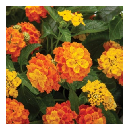
SOFT ORANGE HUES FIESTA™ PALOMA LANTANA Lantana camana 18" tall, 30" wide. Full sun. Evergreen SKU #46432 | ZONE: 10-11

BOLD OMBRE FIESTA™ PICANTE LANTANA Lantana camara 18" tall, 30" wide. Full sun. Evergreen SKU #46434 | ZONE: 10-11