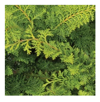
STAYS COMPACT JADE WAVES™ FERNSPRAY FALSE CYPRESS

Chamaecyparis obtusa 'MonYur' PP #29,503 This elegant and distinctive evergreen features curved limbs and fern-like foliage. The pyramidal form is perfect for large planters or as an entryway accent. 8' tall, 4' wide. Full sun. Evergreen SKU #07228 | ZONE: 4-8