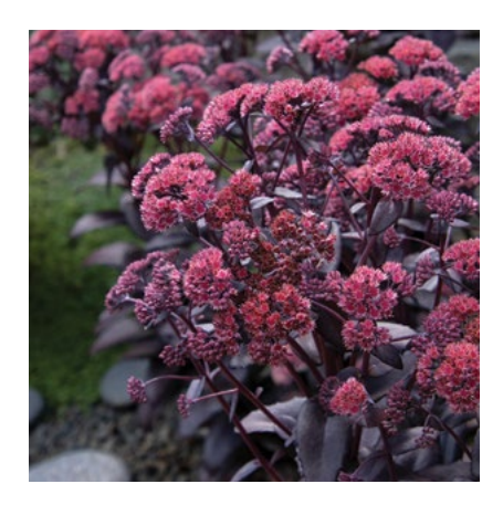
DRAMATICALLY DARK EVOLUTION™ CHOCOLATE FOUNTAIN SEDUM Sedum 'TNSEDECF' PPAF 15" tall and wide. Partial to full sun. Evergreen in mild winter regions.

THESE MOUNDING SEDUMS WERE BRED for vigorous branching that will not fall open. The dense colorful foliage is cloaked with summer blooms that are adored by pollinators.