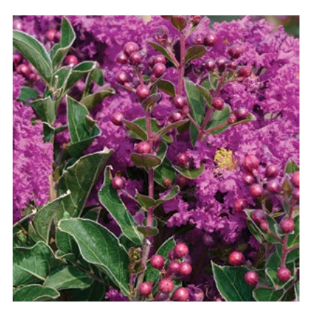
VIBRANT COLOR SUMMERLASTING® PLUM CRAPE MYRTLE Lagerstroemia indica 'HOCH1065' PP #33,178 3' tall and wide. Full sun. Deciduous SKU #43903 | ZONE: 7-10