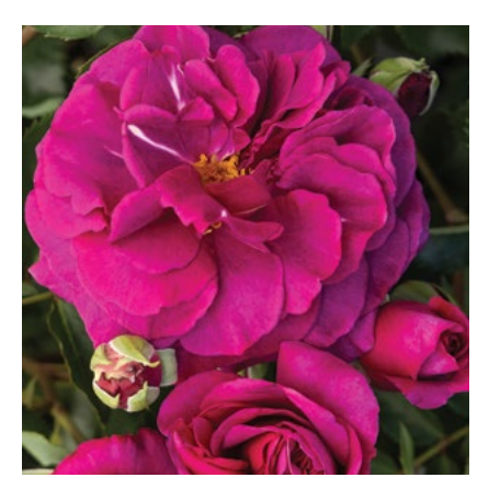
FUCHSIA-PURPLE PETALS EAU DE PARFUM™ BERRY ROSE Rosa 'Noa1112130' PP #29,746 4' tall and wide. Full sun. Deciduous SKU #43160 | ZONE: 5-10

BIG, DELIGHTFULLY FRAGRANT BLOOMS PROVIDE THE CLASSIC ROMANCE of roses with the added benefit of disease resistance brought to you by modern breeding. The lush foliage makes these excellent shrubs in the garden. Blooms repeatedly from early spring until first frost, providing plenty of roses for bouquets.