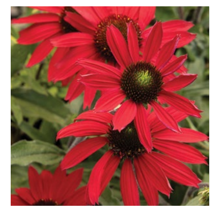
GLOWING COLOR EVOLUTION™ EMBERS™ FEVER CONEFLOWER Echinacea 'TNECHEF' PP #31,466 20" tall, 18" wide. Full sun. Perennial SKU #42874 | ZONE: 4-9