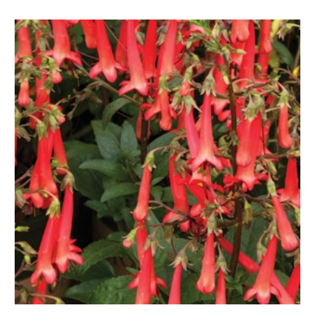
TRUE RED BLOOMS COLORBURST™ DEEP RED CAPE FUCHSIA Phygelius 'TNPHYCDR' PPAF 3' tall, 2' wide. Partial sun. Perennial SKU #43419 | ZONE: 6-10

YOU'RE LIKELY TO SEE HUMMINGBIRDS flying about these delightful dangling flowers that bloom prolifically from midsummer to fall. Sturdy upright stems create a shrubby form with attractive, shiny green foliage. May remain evergreen in mild-winter areas.