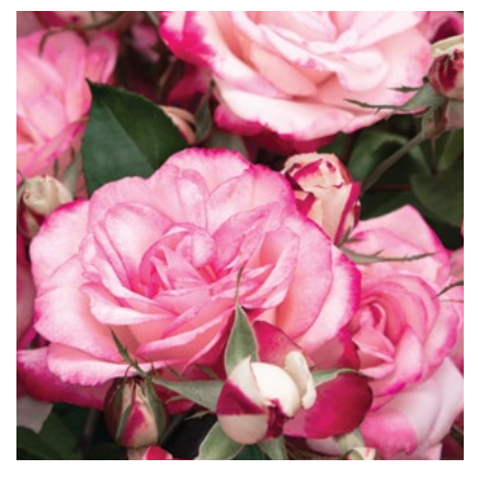
STRIKING COLOR GRACE N' GRIT™ PINK BICOLOR SHRUB ROSE Rosa 'Meiryezza' PP #30,844 5' tall, 4' wide. Full sun. Deciduous SKU #42123 | ZONE: 4-9