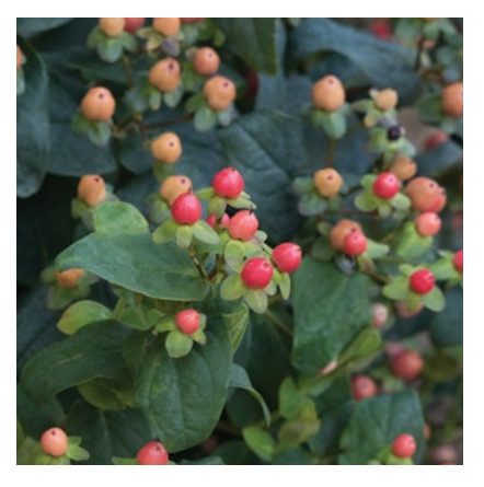
STRIKING RED BERRIES FLORALBERRY<sup>®</sup> PINOT ST. JOHN'S WORT Hypericum x inodorum 'KOLPINOT' PPAF 3' tall and wide. Partial shade to full sun. Deciduous SKU #41805 | ZONE: 5-9

3' tall and wide. Partial shade to full sun. Deciduous SKU #41802 | ZONE: 5-9