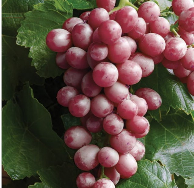
FLAVORFUL RED GRAPES ZESTFUL™ LOLLIPOP GRAPE Vitis 'IFG Twenty-seven' PP #29,963

Unique, sweet and delicious finger-like green grapes hang in long, loose clusters on this fastgrowing vine. Seedless fruits are produced in abundance, ripening in late summer. Well-suited for the warmer regions of the U.S. Climbs 10 to 25' each year. Full sun. Deciduous SKU #41549 | ZONE: 7-9