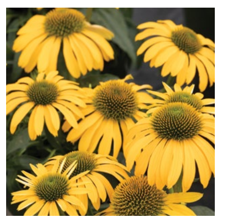
LONG BLOOMING EVOLUTION™ YELLOW FALLS CONEFLOWER Echinacea 'Balevoelf' PP #31,064 20" tall, 18" wide. Full sun. Perennial SKU #41362 | ZONE: 4-9