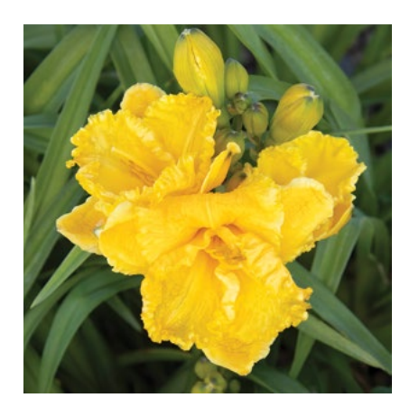
SUNNY COLOR SAFFRON SKYE™ DAYLILY Hemerocallis x 'MON9010' PPAF 18" tall and wide. Full sun. Perennial SKU #44426 | ZONE: 4-11