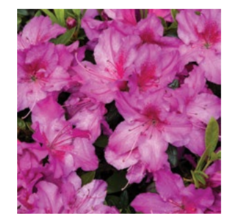
VIBRANT SINGLE BLOOMS DOUBLE SHOT® GRAPE AZALEA Azalea x 'RLH1-14P14' PP #24,751 3' tall and wide. Full shade to partial sun. Evergreen SKU #41203 | ZONE: 6-9