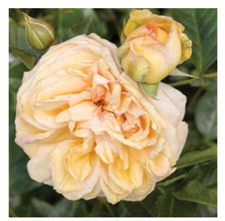
CHAMPAGNE BLOOMS EAU DE PARFUM™ BUBBLY ROSE Rosa 'Noa1112130' PP #29,746 4' tall and wide. Full sun. Deciduous SKU #43155 | ZONE: 5-10

BLUSH PINK ELEGANCE EAU DE PARFUM™ BLUSH ROSE Rosa 'Noa1811108' PP #28,988 4' tall and wide. Full sun. Deciduous SKU #43156 | ZONE: 5-10