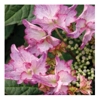
CRYSTAL COVE HYDRANGEA Hydrangea macrophylla 'CAMFRE29' PPAF Frilly lacecap blooms are edged with deep purple-blue when grown in acidic soils, deep pink when grown in neutral or alkaline soils. Partial sun. Deciduous SKU #43342 | ZONE: 4-9

YOU'LL SWOON FOR OUR EVER-EXPANDING Seaside Serenade® collection of superior hydrangeas. With sturdier stems and thicker foliage, Seaside Serenade® hydrangeas tolerate heat, humidity, and wind. Flowers rebloom throughout the season. Tidy shrub, 3' tall and 4' wide.