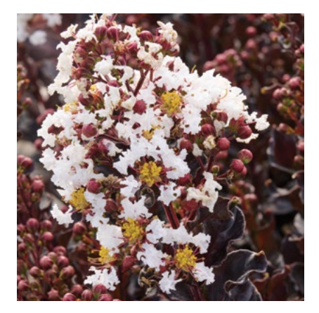
PURE WHITE SUMMERLASTING® COCONUT CRAPE MYRTLE Lagerstroemia indica 'HOCH873' PP #33,209 3' tall and wide. Full sun. Deciduous SKU #43918 | ZONE: 7-10

landscapes. Flowers appear earlier and extend through summer, providing nonstop color. Compact with excellent branching-perfect for small spaces.