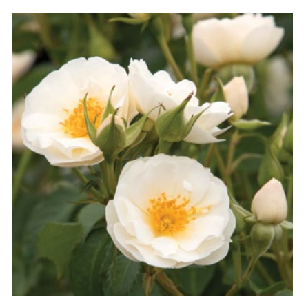
CLASSIC VERSATILITY NITTY GRITTY™ WHITE ROSE Rosa 'BOKRARUISP' PP #33,151 Fast growing; 3' tall, 4' wide. Partial to full sun. Deciduous SKU #42041 | ZONE: 4-9