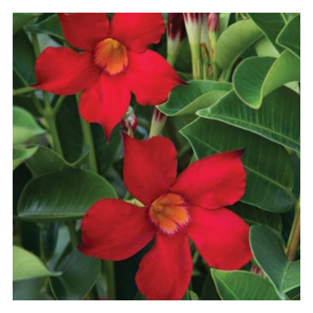
DEEP RED WITH A YELLOW THROAT SUNVILLA™ RED MANDEVILLA Mandevilla 'MANZ0018' PPAF Stems to 20' long. Partial to full sun. Evergreen in frost-free areas. SKU #44337 | ZONE: 9-11

EXTRA LARGE RED BLOOMS SUNVILLA™ GIANT RED MANDEVILLA Mandevilla 'MANZ0019' Stems to 20' long. Partial to full sun. Evergreen in frost-free areas. SKU #45045 | ZONE: 9-11