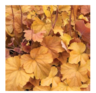
FLOWERS FOR POLLINATORS NORTHERN EXPOSURE™ AMBER HEUCHERA

THESE COLORFUL VARIETIES have superb long-lasting foliage, rust resistance and longevity due to hardy parentage. Form tidy mounds of leaves that are excellent in borders and containers.