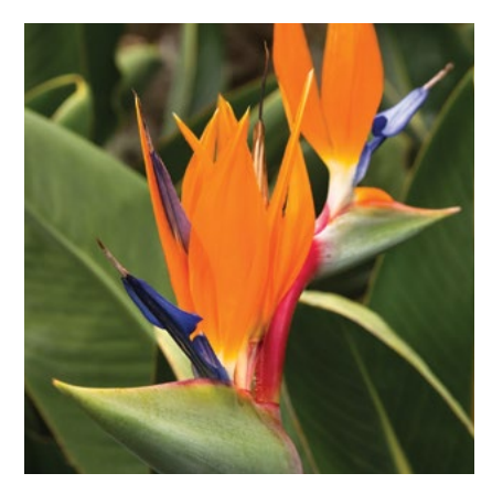
BIRD OF PARADISE Strelitzia reginae The beloved tropical with striking blooms. 3' tall and wide. Partial to full sun SKU #07175

PURPLE HEART Setcreasea pallida The spreading stems are perfect for hanging planters. 12 to 18" tall and wide. Filtered to full sun SKU #01188