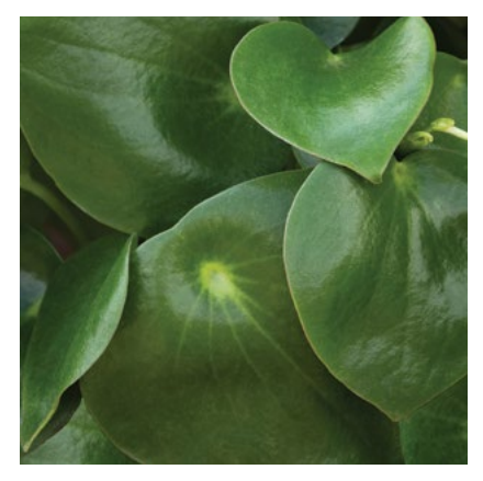
RAINDROP PEPEROMIA Peperomia polybotrya Prized for its easy of care and low water needs. 12" tall and wide. Filtered sun SKU #45053