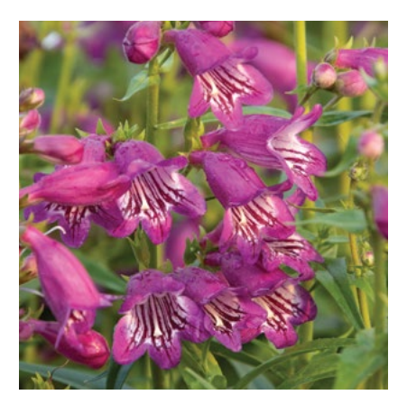
ROYAL PURPLE WITH STRIPED THROATS HARLEQUIN™ PURPLE BEARDTONGUE Penstemon 'TNPENHPU' PPAF 22" tall, 16" wide. Full sun. Perennial SKU #43417 | ZONE: 5-9