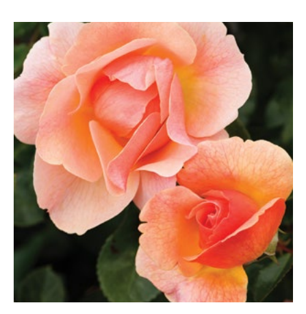
LUMINESCENT COLOR NITTY GRITTY™ PEACH ROSE Rosa x 'RUIRI0091A' PP #33,152 Fast growing; 3' tall, 4' wide. Partial to full sun. Deciduous SKU #42052 | ZONE: 4-9