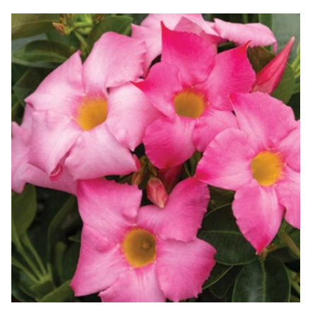
EYE-CATCHING VIBRANT PINK SUNVILLA™ PINK MANDEVILLA Mandevilla 'MANZ0014' PPAF Stems to 20' long. Partial to full sun. Evergreen in frost-free areas. SKU #44333 | ZONE: 9-11