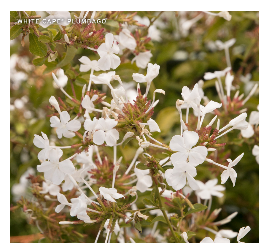
WHITE CAPE® PLUMBAGO (Plumbago auriculata 'Monite') MULTI-USE INFORMAL HEDGE

FULL TO PARTIAL SUN | UP TO 5' TRUNK WITH A 3' TO 5' WIDE CROWN OF FOLIAGE | ZONES 9-11